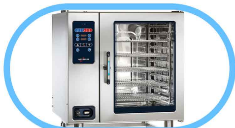
STEAM COMBI OVENS