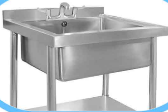
SMALL POTWASH SINKS