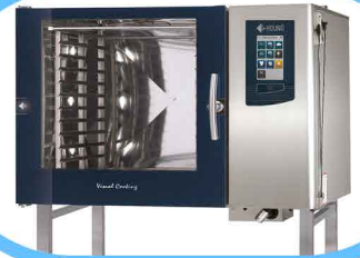
SMALL COMBI OVENS