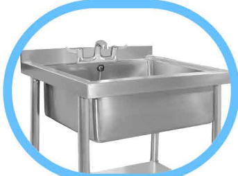
SMALL POTWASH SINKS