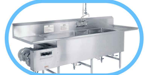
LARGE POTWASH SINKS