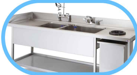
DOUBLE BOWL SINKS