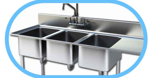
TRIPLE BOWL SINKS