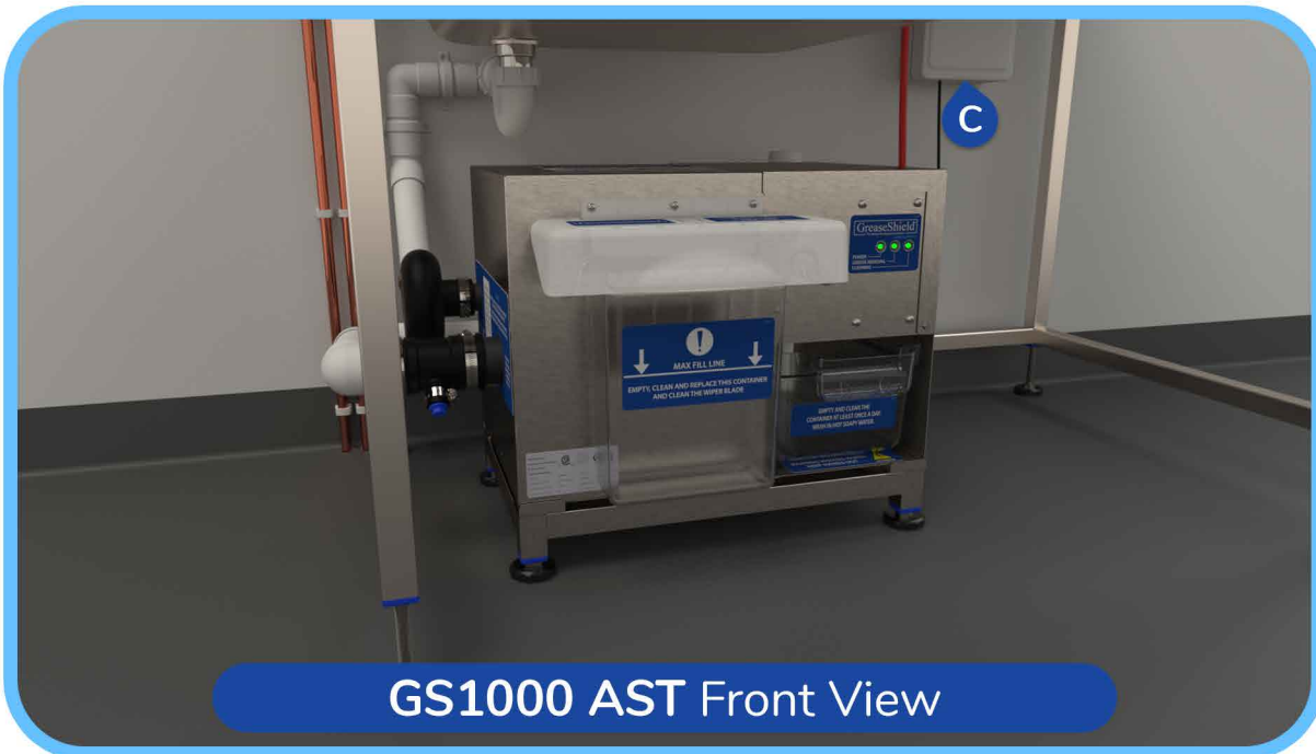
GS1000 AST Front View