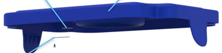
Breather Spring 0514P05-A