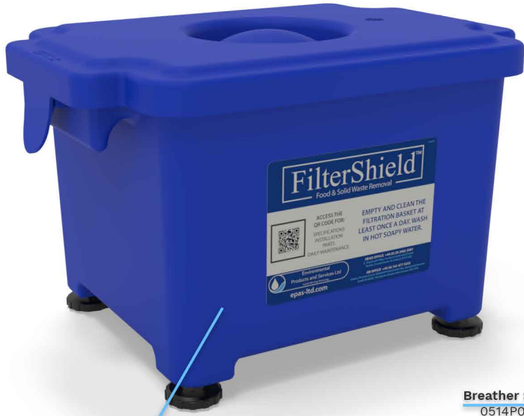
FS2000 Tank 0514P01-E