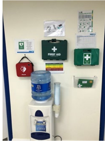
First Aid box, Accident book and defibrillator