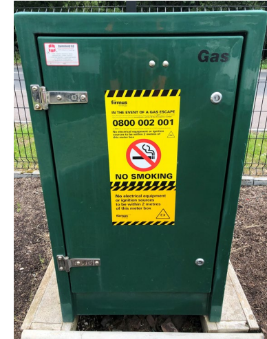
Gas Meter Cabinet