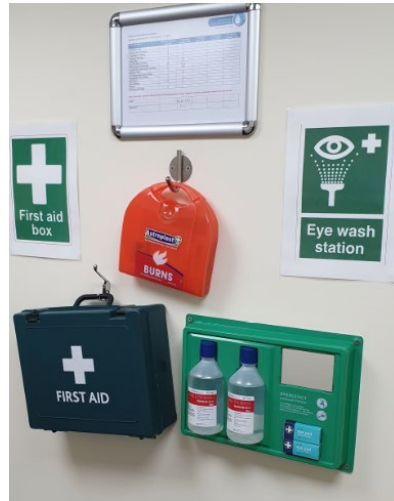
First Aid box, Accident book and defibrillator