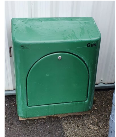
Gas Meter Cabinet