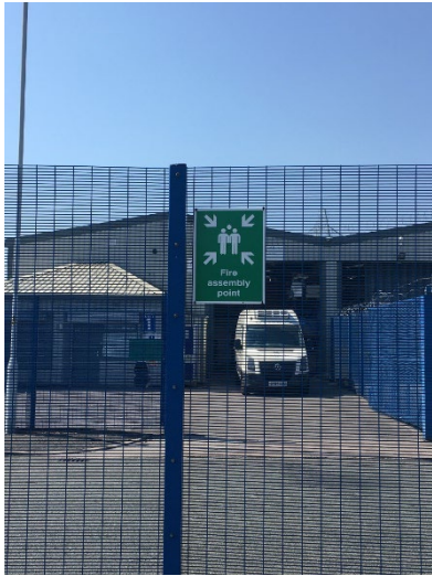
Fire Assembly Point