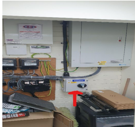
Electrical Isolation Switch