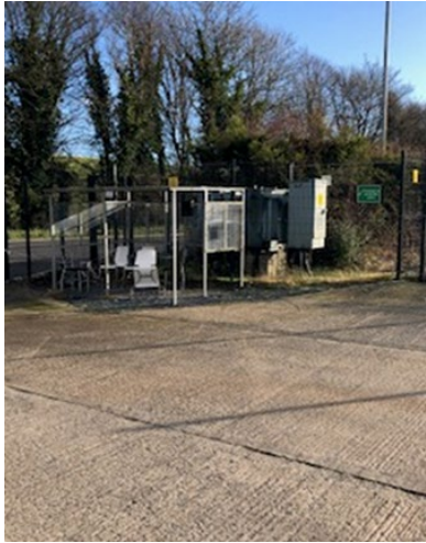
Fire Assembly Point